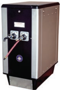
GUARDIAN with COMPRESSOR & TANK Series 80