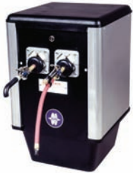
HOSE GUARDIAN Series 50, 51