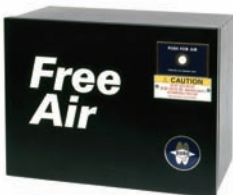
AIR GENIE Series 93