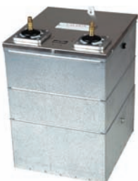
UNDERGROUND HOSE REELS